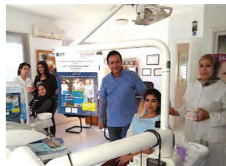
Periodontal screening and advice (Morocco)

Day 2017. "This is unprecedented in European dentistry and I am deeply grateful to dozens of colleagues volunteering throughout Europe to make this day a very special one."