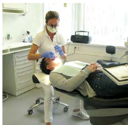
Free periodontal screening (Netherlands)

"We have to acknowledge the tremendous efforts of 27 national societies in making the very same day a massive campaign for the good of the population," said Filippo Graziani, EFP co-ordinator of European Gum Health