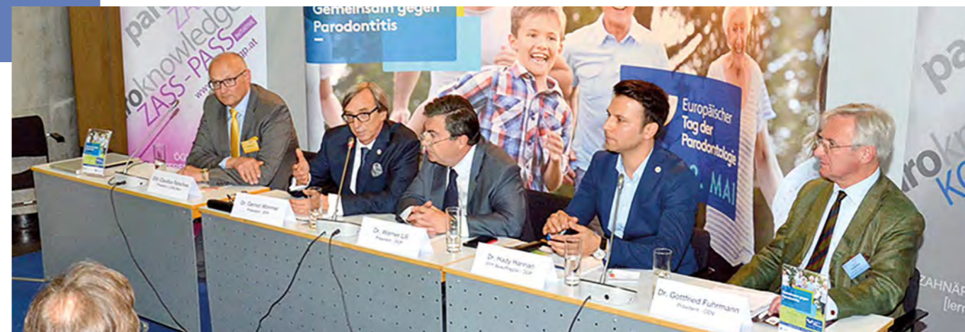
EFP president Gernot Wimmer (second from left) at press conference (Austria)

of the then 29 EFP member societies were involved, a participation level of 72 per cent.