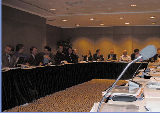
General Assembly in Stockholm