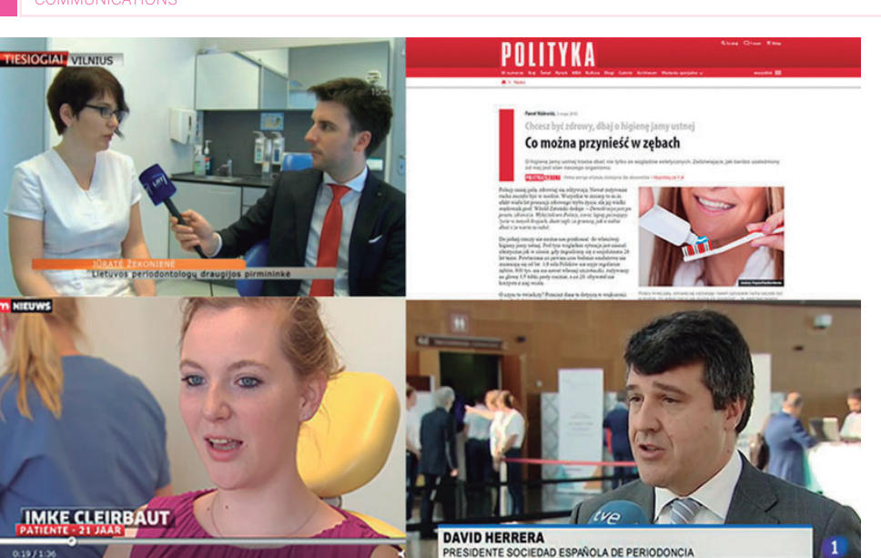
The European Day of Periodontology generated extensive media coverage across Europe. Here, examples from (clockwise from top left) Lithuania, Poland, Spain, and Belgium