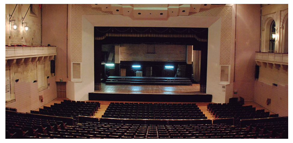
The auditorium in the Mediterranean Conference Centre, Valetta

with all the benefits of modern technology. Delegates can register for the Perio Master Clinic 2017 via the EFP website. EFP members pay €450 while the fee for non-members is €590. The registration fee includes participation in the congress programme, congress materials, attendance at the welcome reception on Friday, March 3, and admission to the industry exhibition.