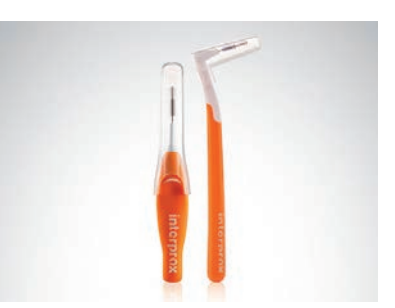
INTERPROX <sup>®</sup> is a wide range of specialty brushes designed to remove oral biofilm from interproximal spaces. The flexible handle of INTERPROX <sup>®</sup> and the lengthier angled handle of INTERPROX <sup>®</sup> Plus allow easy access to the different interproximal spaces for complete oral hygiene.