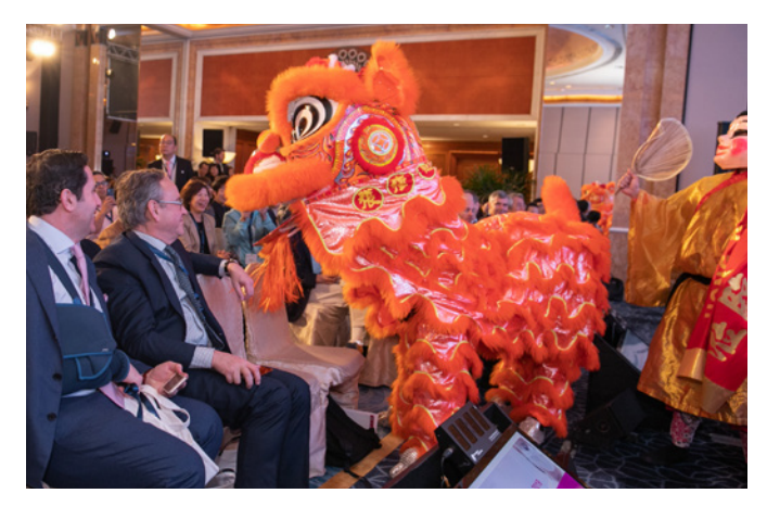
Participants enjoyed a colourful opening ceremony

Dedicated to "Peri-implantitis: Prevention and treatment of soft- and hard-tissue defects," the well-attended event featured