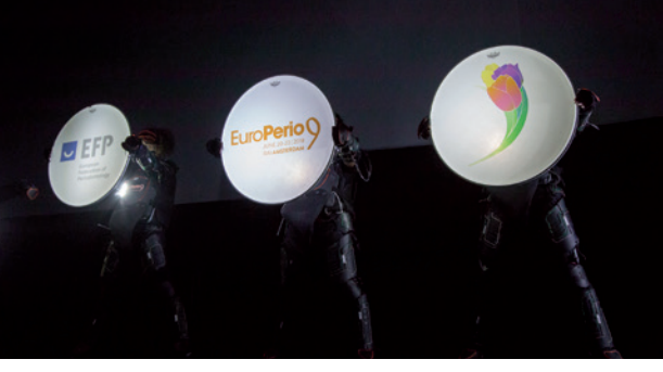
A moment during the opening ceremony