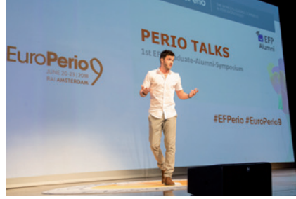
One of the young speakers in Perio Talks

A presentation in the main auditorium at RAI Amsterdam