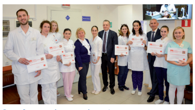
Russia: Competition for young professionals

The Serbian Society of Periodontology organised events to promote periodontal health within European Gum Health Day 2018, with seminars for doctors and educational activities for patients. The society also launched and promoted the new EFP projects in collaboration with leading national hospitals.