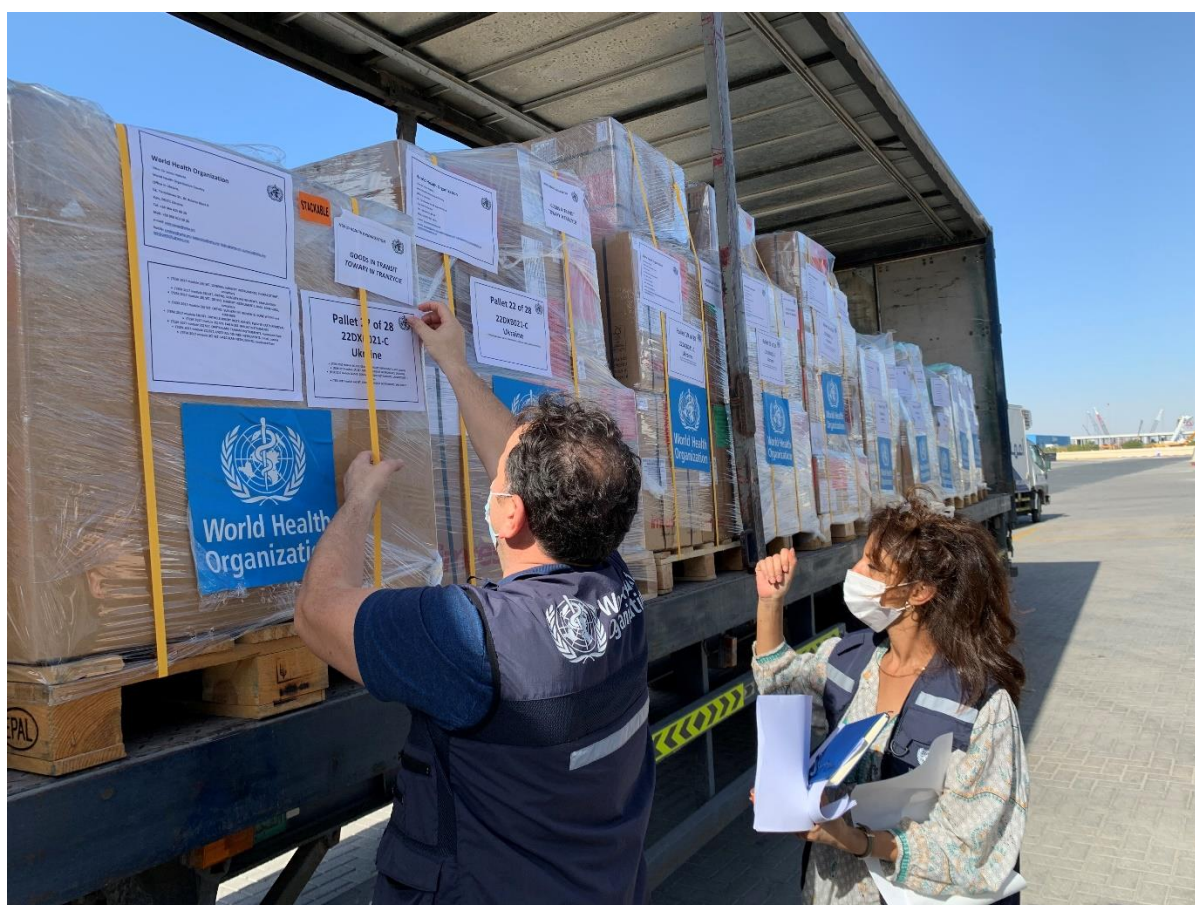
A WHO team in Warsaw Airport receives medical supplies destined for Ukraine