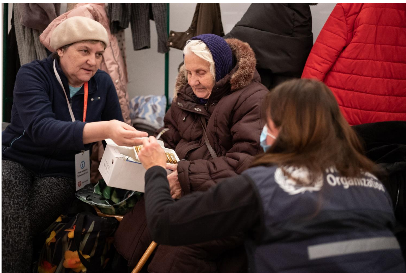
Volunteer nurse supporting refugees with their health needs at a reception centre near the Polish-Ukrainian border.

The Public Health Situation Analysis for refugee-receiving countries was published on 17 March and contains a detailed analysis of the key public health priorities and health risks facing refugees leaving Ukraine. The health threats are similar to those for Ukraine, but need to be interpreted in the light of the population demographics (with proportionally more children and women than for the general population in Ukraine) and of factors linked to displacement that may worsen health conditions or increase the risk of disease.