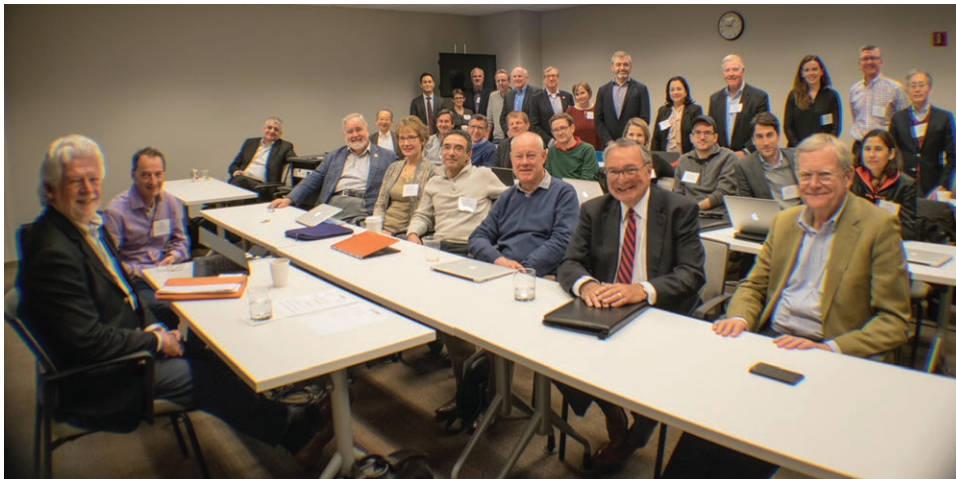
FIGURE 1 Participants of Workgroup 1