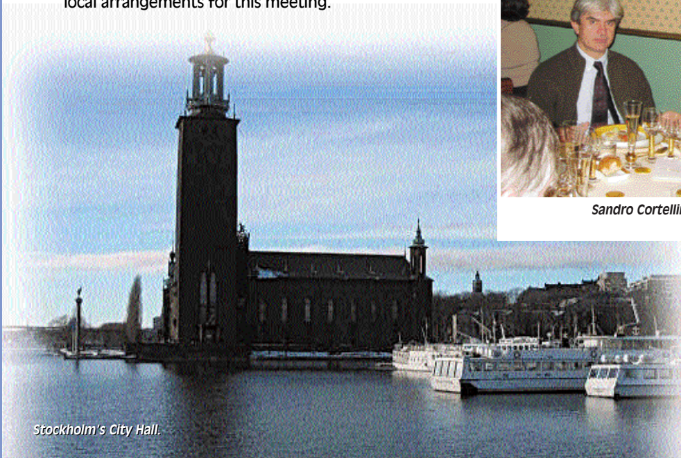
Stockholm's City Hall.