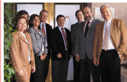
EuroPerio 5 Organising Committee at SEPA