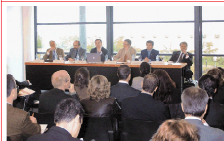
The EuroPerio 5 Organising Committee meets the industrial partners