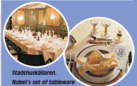
Stadshuskällaren. Nobel's set of tableware