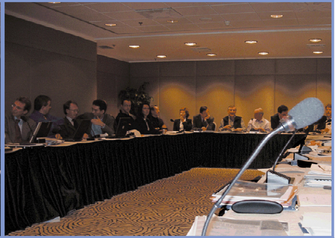
General Assembly in Stockholm