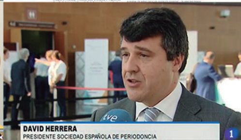
The European Day of Periodontology generated extensive media coverage across Europe. Here, examples from (clockwise from top left) Lithuania, Poland, Spain, and Belgium

of Periodontology was hailed as a “huge success” by EFP president Juan Blanco, who praised the involvement of most of the federation’s national perio societies.