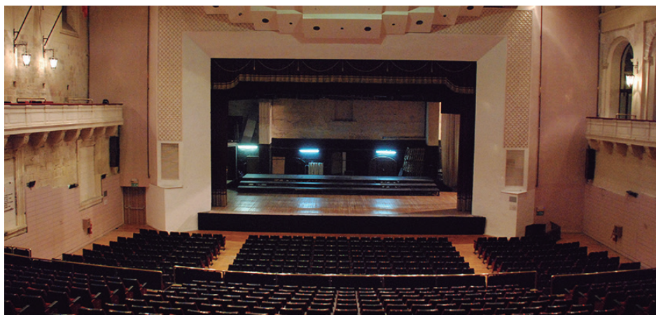
The auditorium in the Mediterranean Conference Centre, Valletta

with all the benefits of modern technology. Delegates can register for the Perio Master Clinic 2017 via the EFP website. EFP members pay €450 while the fee for non-members is €590. The registration fee includes participation in the congress programme, congress materials, attendance at the welcome reception on Friday, March 3, and admission to the industry exhibition.