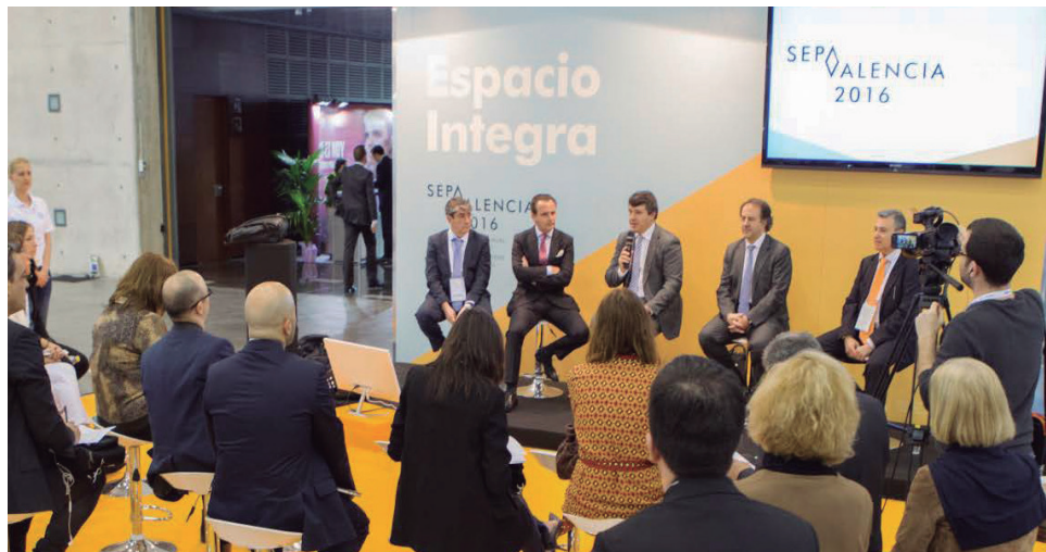
Press conference presenting the Spanish Alliance for Health at the SEPA València 2016 congress, one of the activities staged on May 12, the European Day of Periodontology