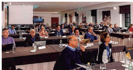
More on p3

Sponsored by Colgate, the workshop took place in La Granja de San Ildefonso, near Segovia in Spain. The conclusions of the workshop will later be published in a special open-access supplement of the EFP’s Journal of Clinical Periodontology .